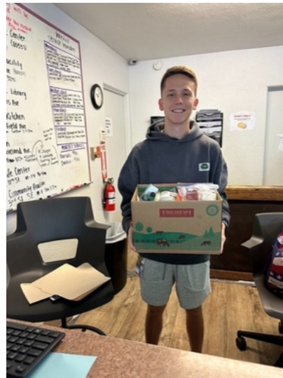
ATV staff person with donations