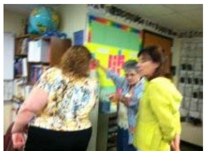
our members and ensuring our work is focused on women and children.

The task forced summarized the input and will be brining it in front of the entire organization at the September meeting to begin the process of meeting the needs of