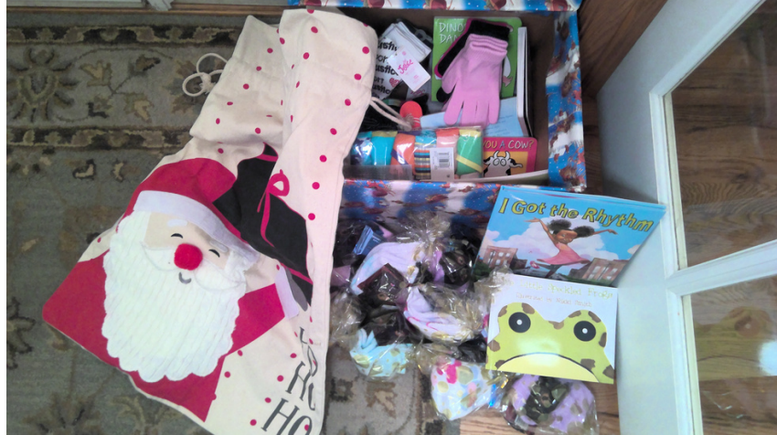
Some donations for Integrated Early Childhood