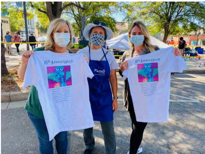
Philo volunteers at Pastels on 5th

*be sure to note you're a Philo donor in the check memo.