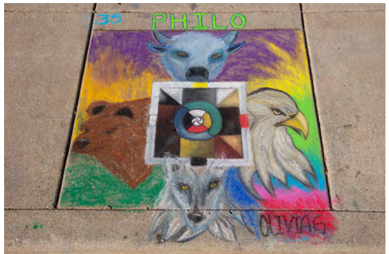
Philo's art square